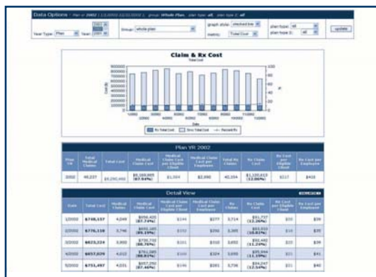
Medical and Pharmacy Claim Costs