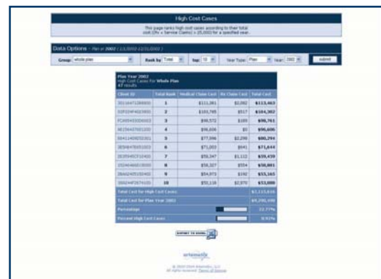
High Cost Cases