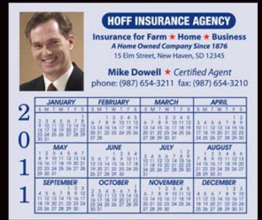
MC01FC 313/32" x 329/32"