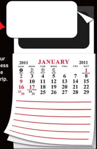
CPPSA3 33/8" x 21/2"

Attach your paper business card to the adhesive strip.