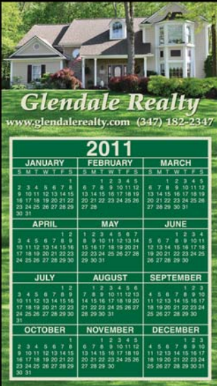
MC05FC 329/32" x 615/16"