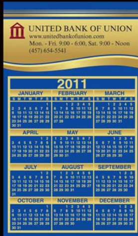
MC06FC 229/32" x 415/16"